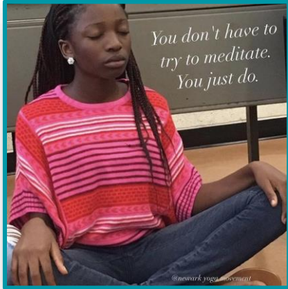
"You don't have to try to meditate. You just do."