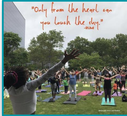
"Only from the heart can you touch the sky." -Rumi